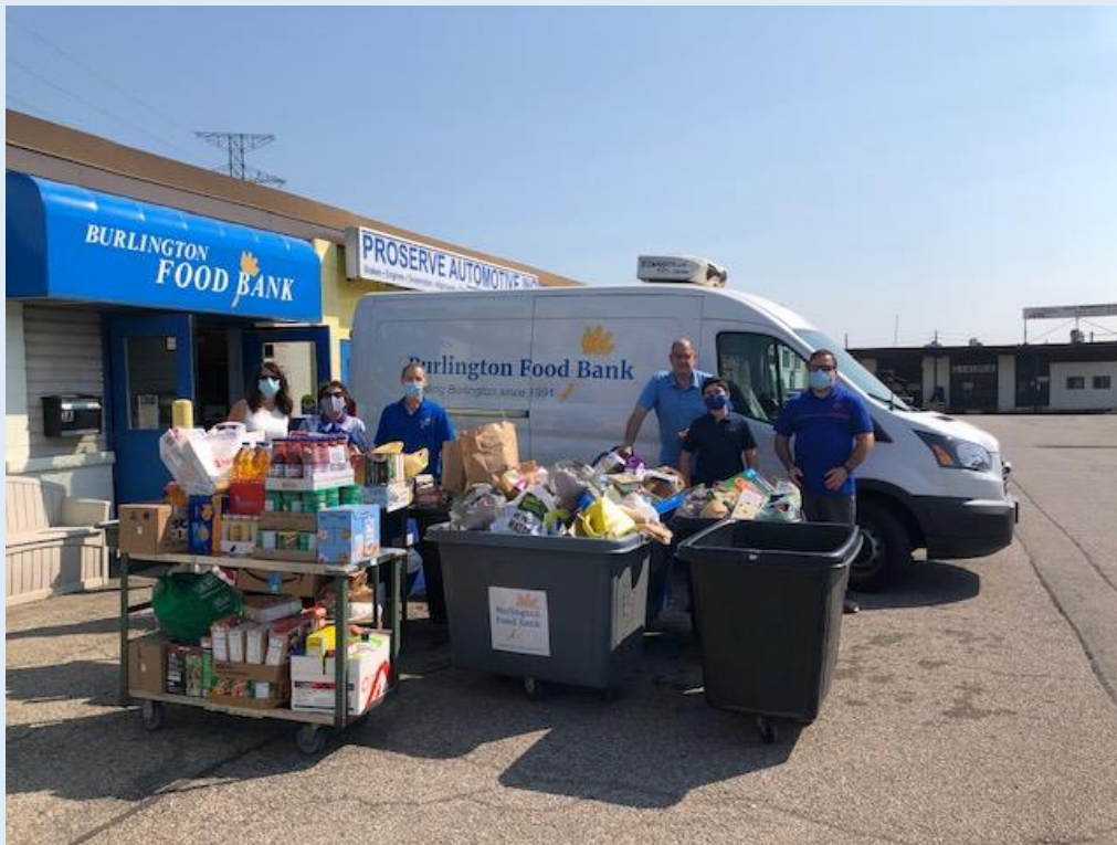
At the Food Bank!