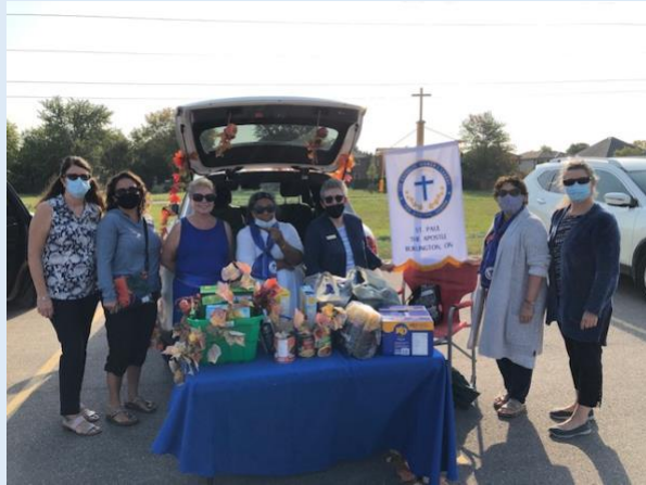
The Saturday Crew!