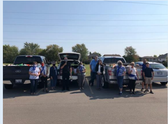
The Sunday Team!